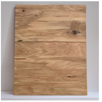
Laminated Blackbutt panel