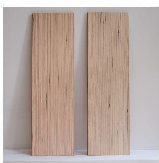
Pink White Gum / White Gum flooring samples