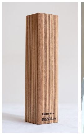
Posts and beams feature each