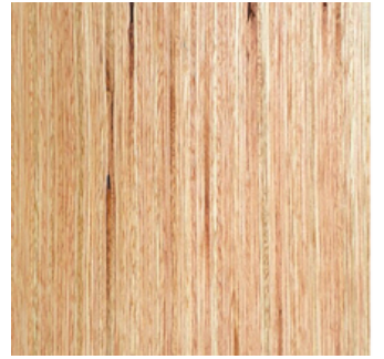
Quartersawn: Linear, consistent and tight grain patterns

This size panel is larger than traditional sizes, often eliminating the need for laminating and offering a cost-effective solution for many applications. Panels can be laminated and joined, and the linear grain across the broad face makes joints more seamless in appearance.